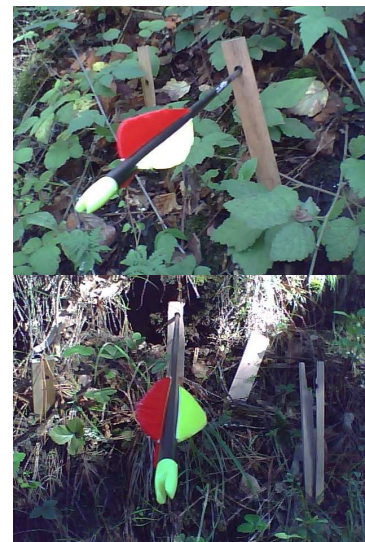
A nice pair of "Holes" by Henry. Both shots were a bit low in the hole; Henry will have to work on elevation.