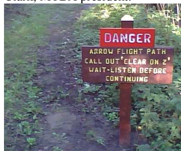
Danger sign approaching target 2.