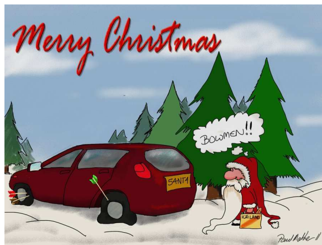
Christmas Card 2011 Archery by moonlight-masquerade

Next month, the small game/stump shoot will be combined with the Look What I Got for Christmas shoot. It is December 26 at 9:00 a.m.