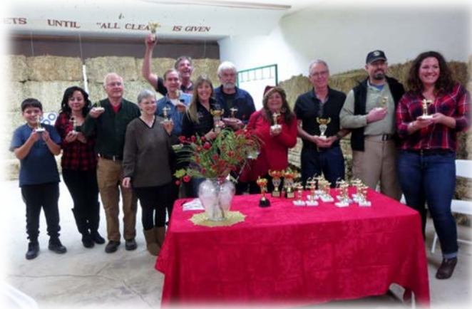
2017 Club Championship 1 st Place Winners with trophies! December 3, 2017

Congratulations on your wins this year. We look forward to your future archery achievements and hope to be adding many more archers to this list next year!