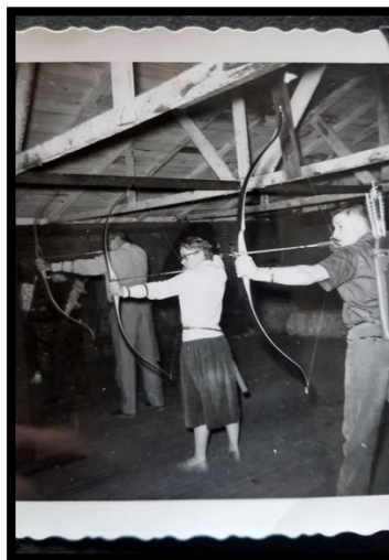
1950s or 1960s at original indoor range

Here is a picture sent to us by Deanna Delaney!